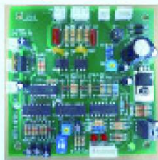
With Surge Protection