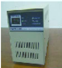
Instrument Lamp Indicating