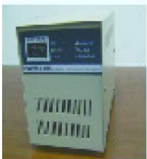
Instrument Lamp Indicating