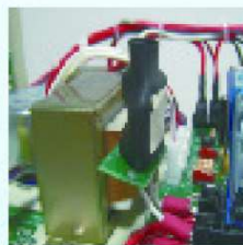
With Surge Protection